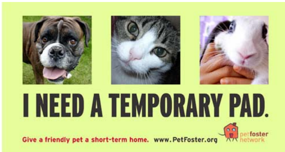
Cinema ad campaign at Southpoint Cinemas, Durham, NC